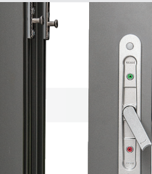
Easy to handle locking mechanism